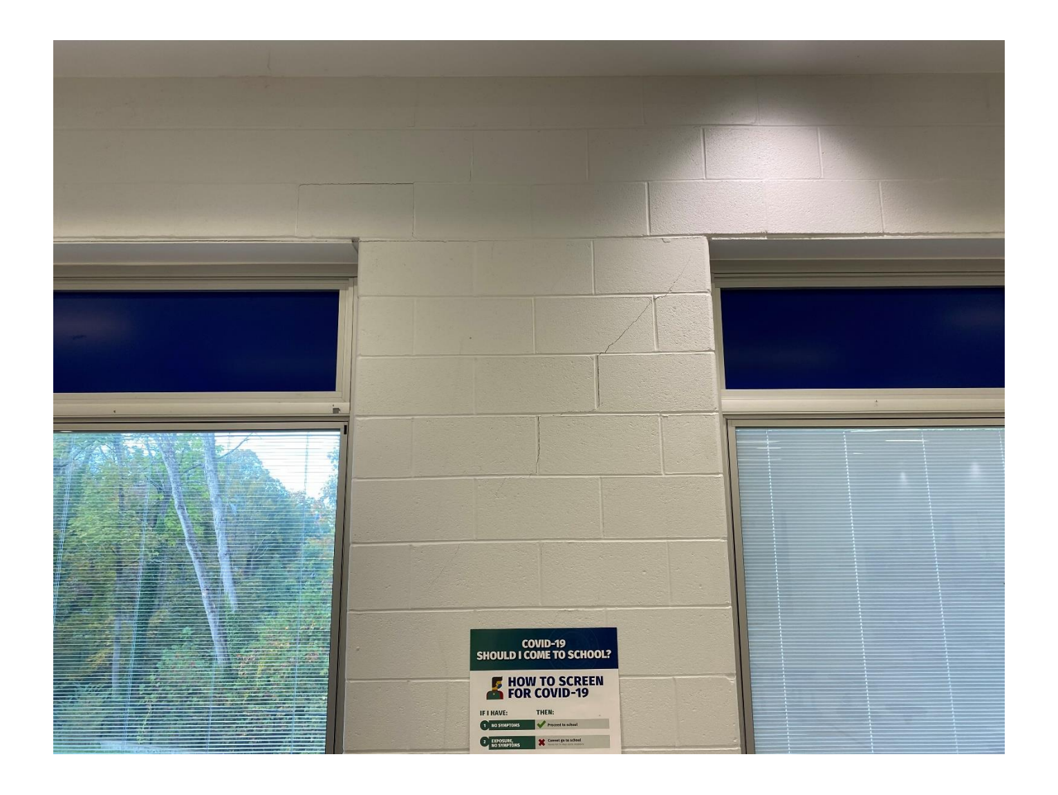
Cafeteria wall close-up Photo #3