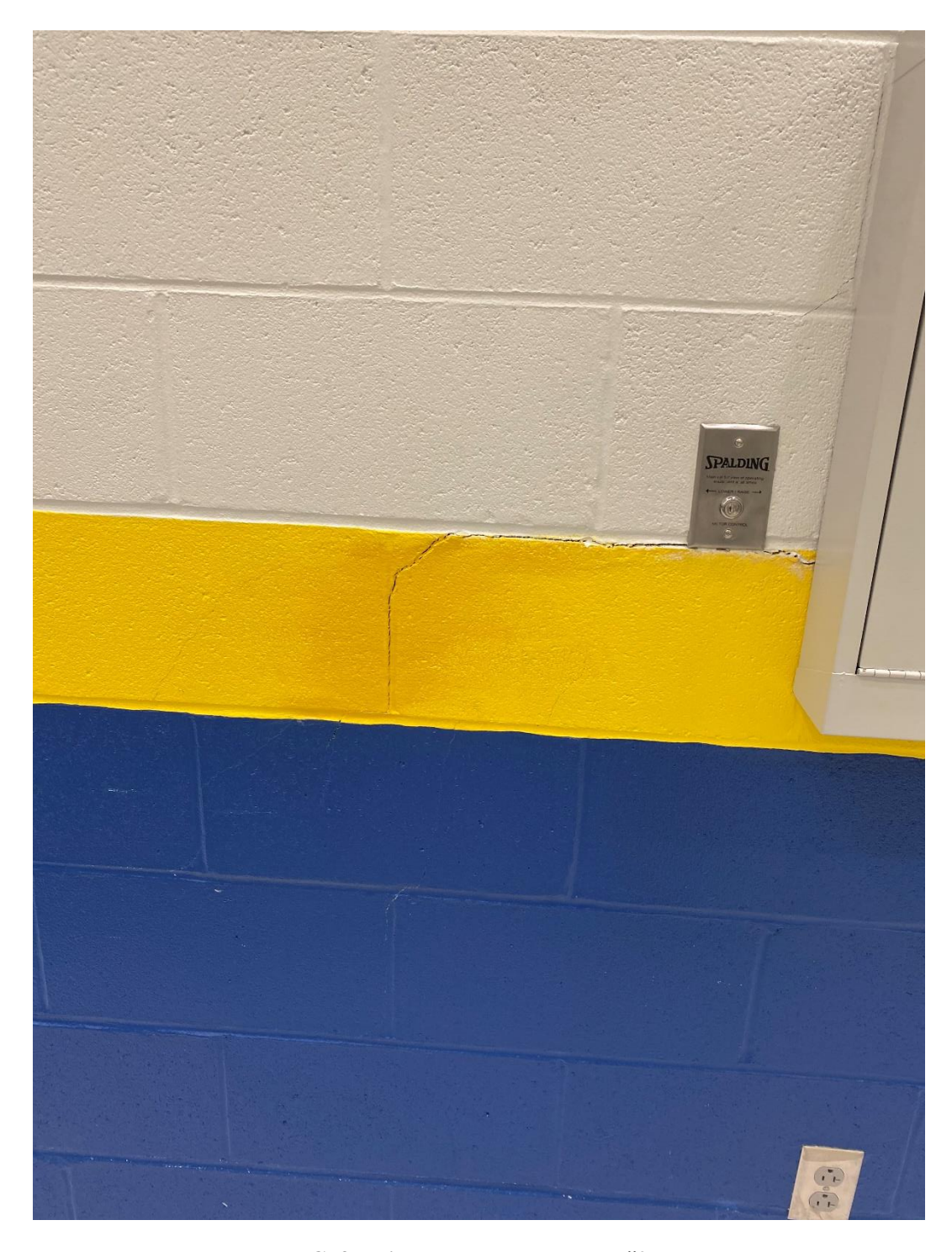
Cafeteria wall close-up Photo #2