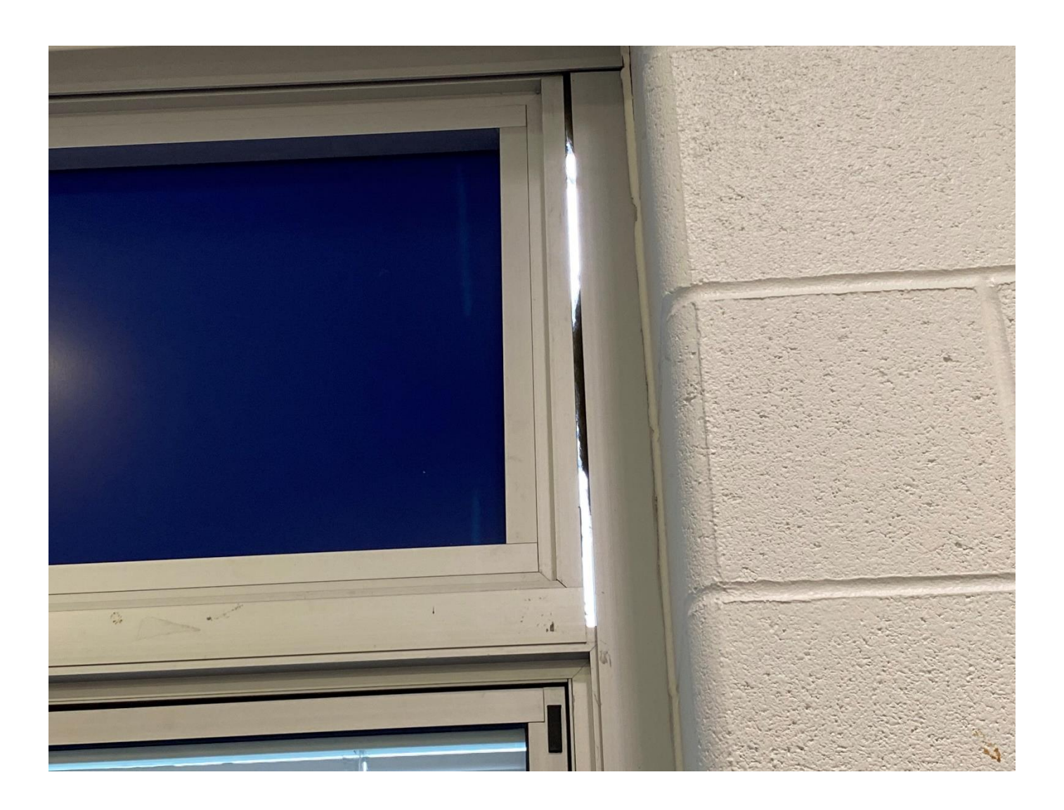
Cafeteria wall close-up Photo #5