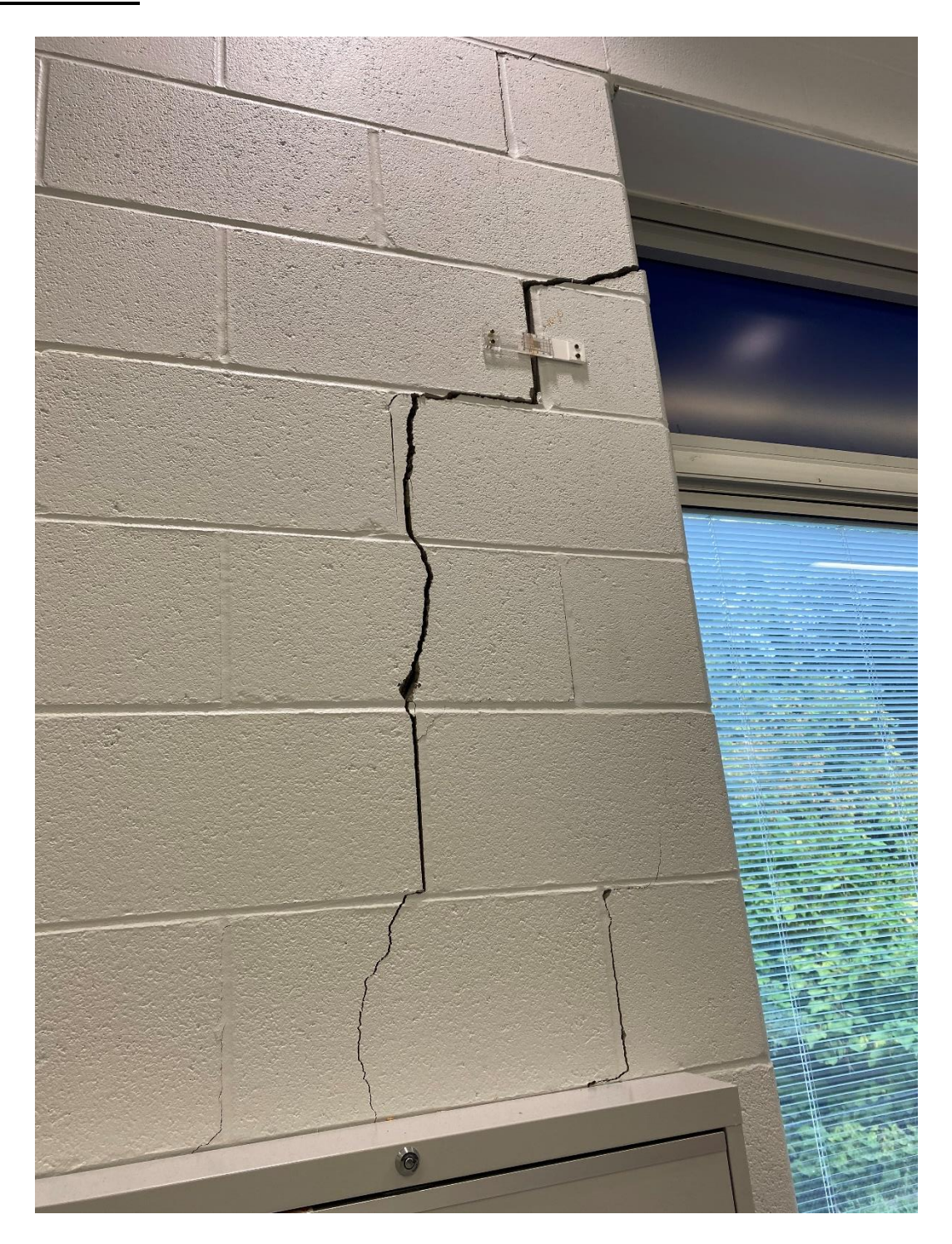
Cafeteria wall close-up Photo #1